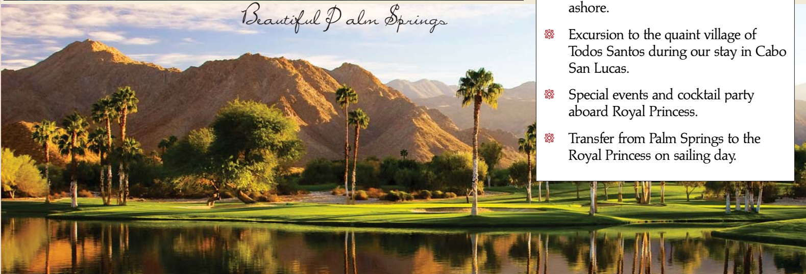
Beautiful Palm Springs