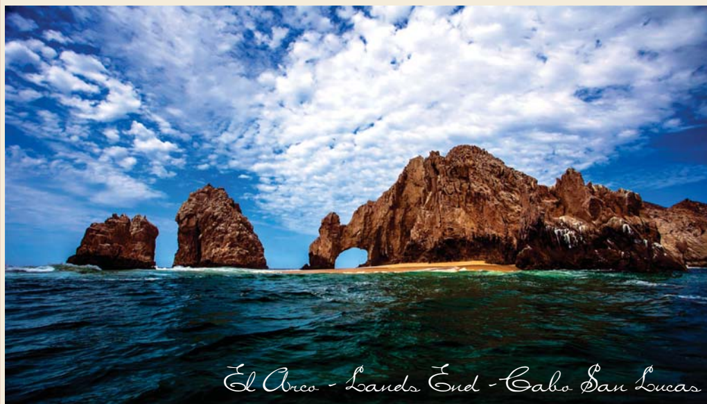
El Arco - Land's End - Cabo San Lucas

Not only is this indulgent getaway affordable, as you would expect we have included some wonderful dining in Palm Springs along with plenty of free time, great sightseeing in Palm Springs and in Cabo San Lucas, special cocktail parties and all transfers. We have even included free train travel from any California city or town to Palm Springs. Offered only once, this fun getaway will sell out so prompt reservations are wise. All Aboard!