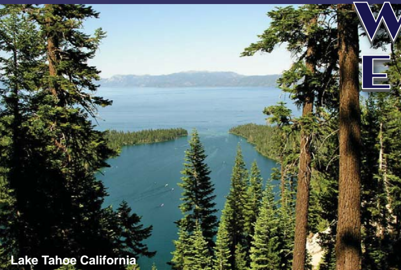
Lake Tahoe California

Fully Escorted Over two Great Mountain Passes