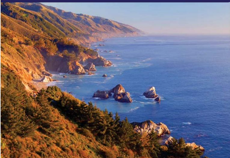
See the California Coast as only seen by Rail.